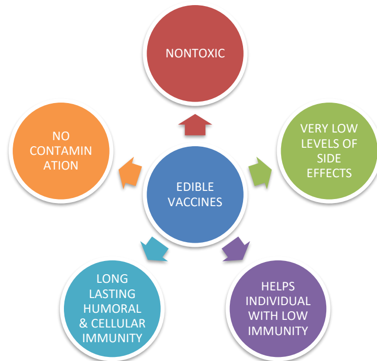
Fig. 1. Feature of an ideal edible vaccine

The mode of action of edible vaccines is similar to that of traditional injectable vaccines, as they stimulate an immune response in the body (Mason et al., 2012). When an individual consumes an edible vaccine, the vaccine antigen, which is usually a protein or other molecule from the target pathogen, is presented to the immune system in the GALT of the intestinal mucosa (Arakawa et al., 1998). This triggers an immune response, including the production of antibodies and other immune cells, which can then recognize and neutralize the target pathogen if the individual is exposed to it in the future. Edible vaccines are designed to survive the digestive process and reach the